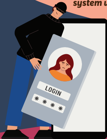
IMAGE-BASED SEXUAL ABUSE

Impersonating someone online by using their personal data, creating fake accounts, or hacking existing accounts to threaten, intimidate, or defraud them.